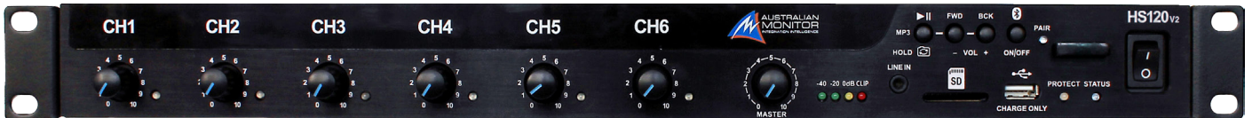
HS120v2 Front Panel

The HSv2 series is Australian Monitor's mid-range Class D mixer amplifiers, delivering high quality audio reinforcement in 60, 120 and 250 watt options, all in a one rack unit package.