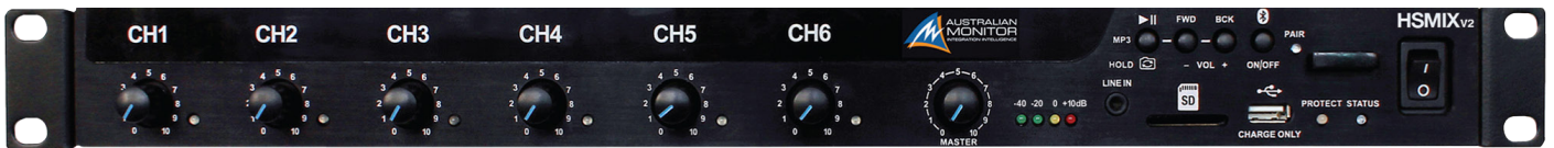
HSMIX v2 Front Panel

The HSMIX v2 now includes an upgraded and programmable Bluetooth 5.1 module allowing customisation of the broadcast name, PIN number and various security features