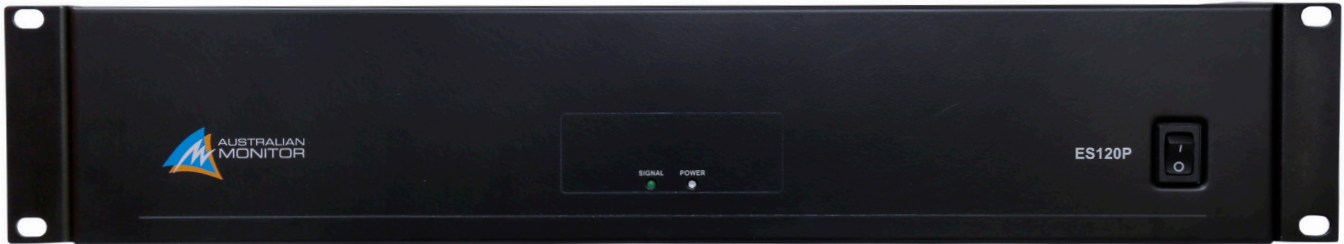
ES120P Front Panel

ES120P • ES250P • ES500P • ES2120P • ES480P