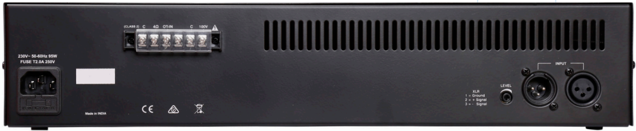
ES120P Rear Panel