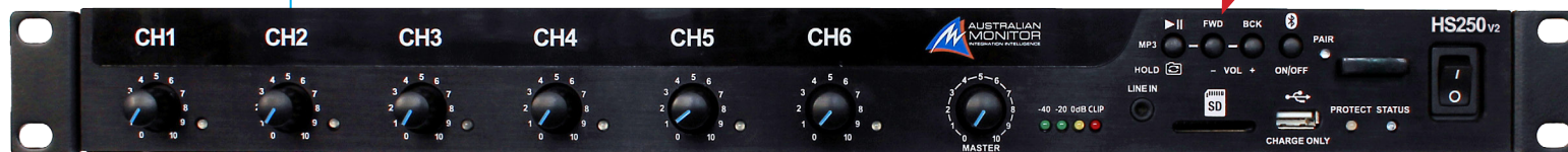
HS250-V2 250 watt mixer amplifier

AMX526 paging microphone connected to input 1