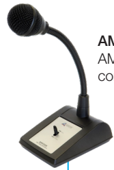
AMX526 - PAGING MICROPHONE AMX526 paging microphone connected to input 1